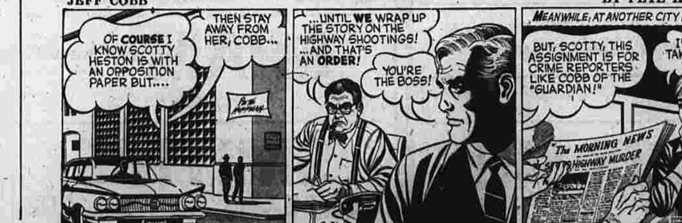
BY PETE HOFFMAN